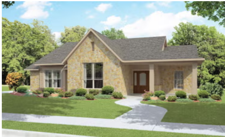
Elevation C - The Frio