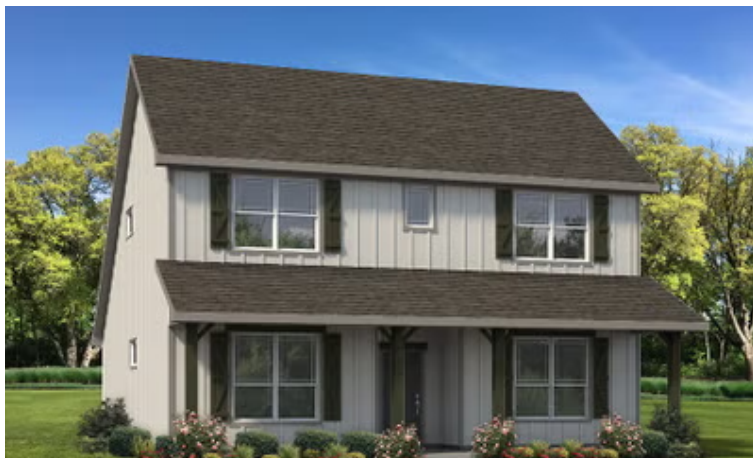
Elevation C - The Goliad