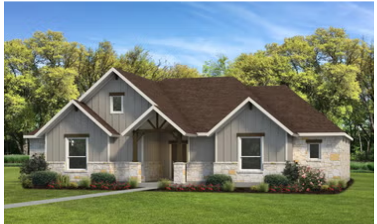
Brazoria D | Front Exterior