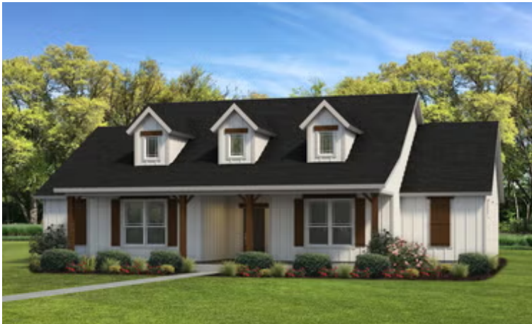
Brazoria C | Front Exterior