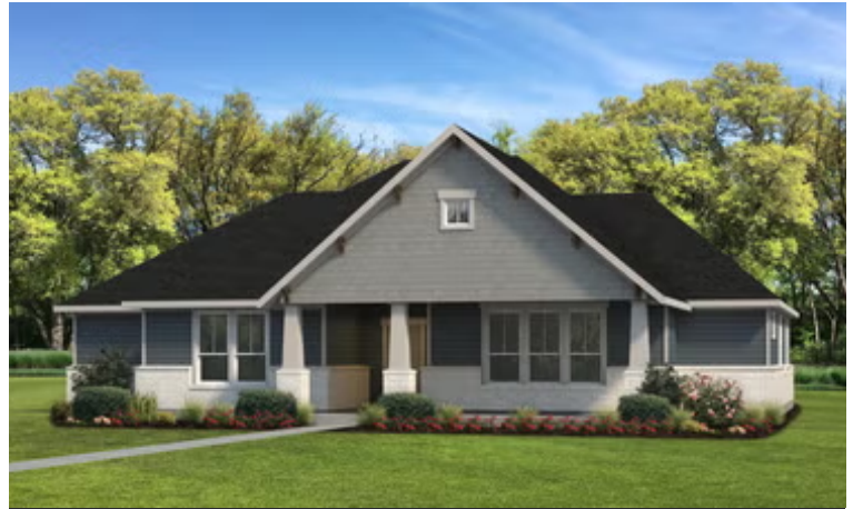
Brazoria B | Front Exterior