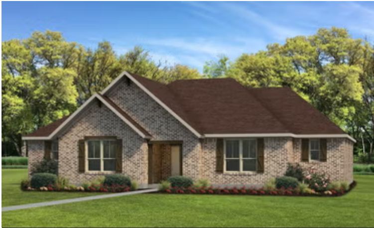
Brazoria A | Front Exterior