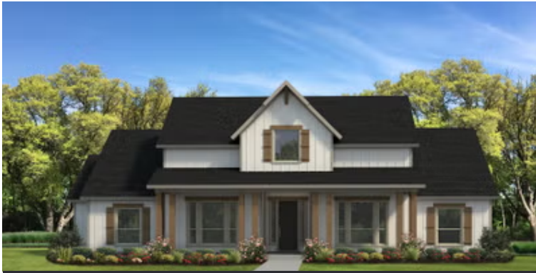
Elevation C | The Woodland