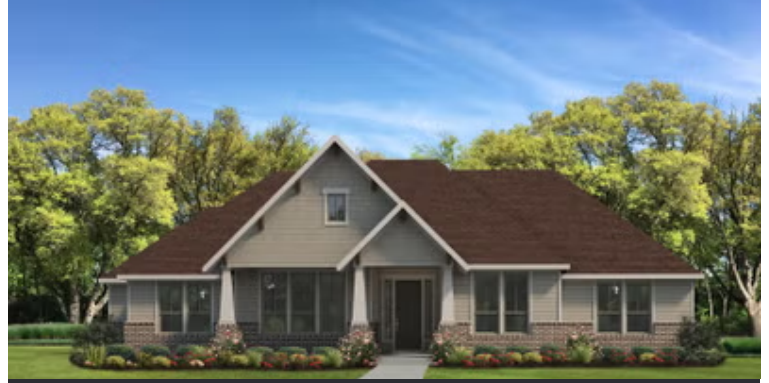
Elevation B | The Woodland