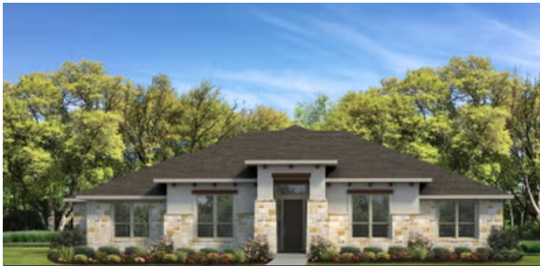
Elevation E | The Woodland