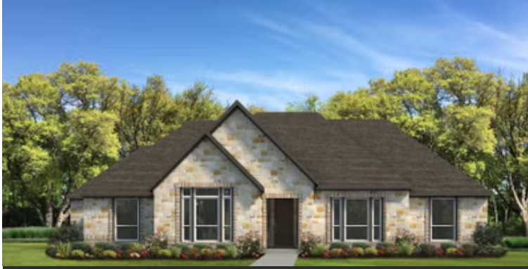
Elevation A | The Woodland