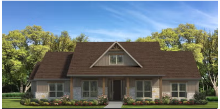
Elevation D | The Woodland