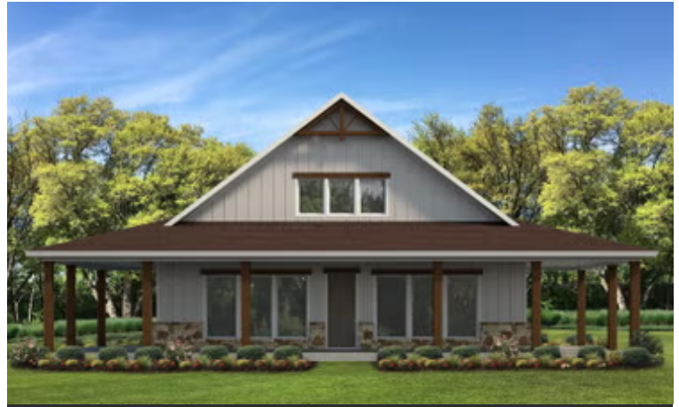
Elevation B | The Marshall