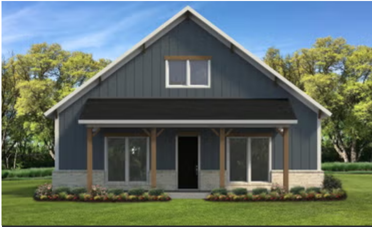
Elevation A | The Marshall