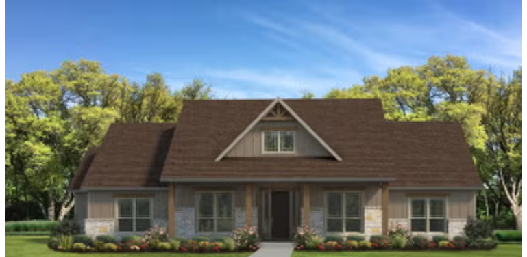
Elevation D | The Woodland