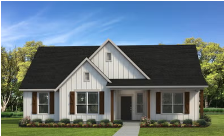
Elevation C - The Whitney