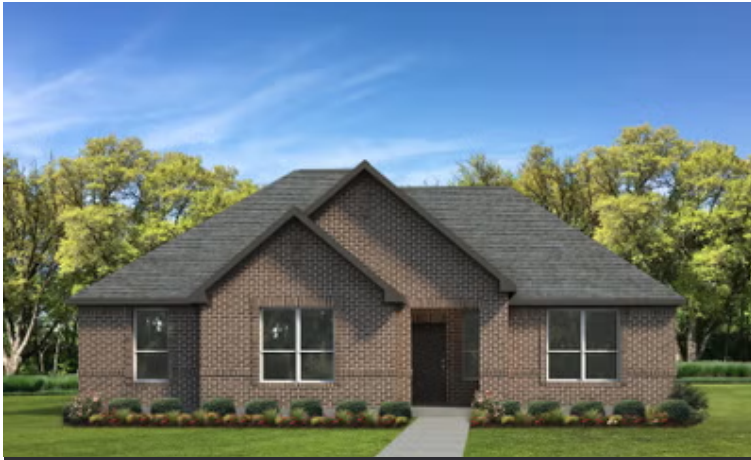
Elevation A - The Whitney