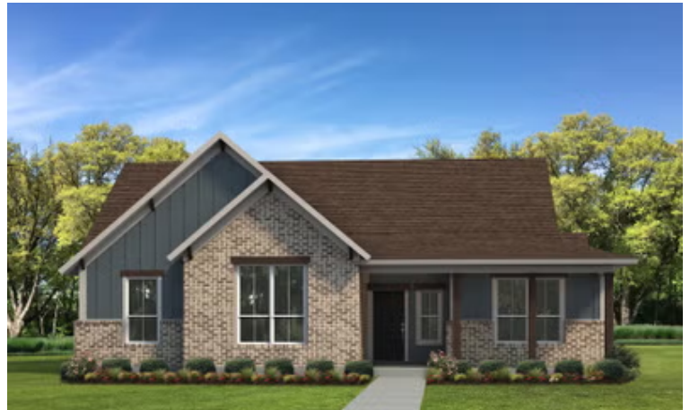
Elevation D - The Whitney