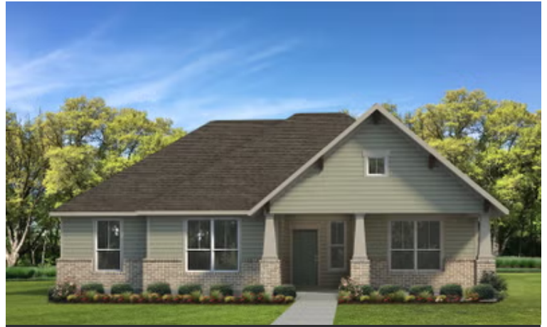
Elevation B - The Whitney