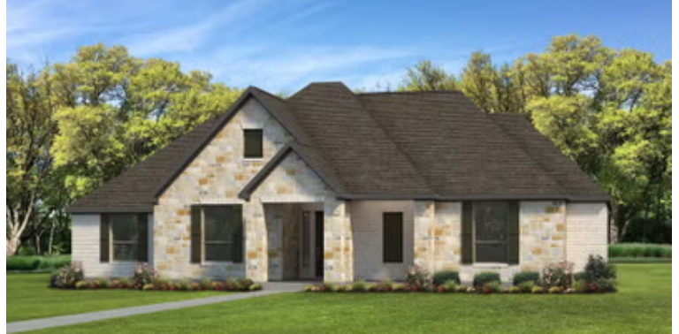
Elevation A | The Barton Springs