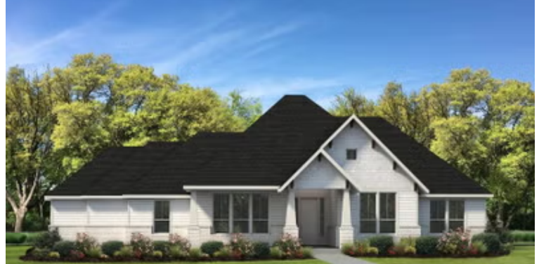
Elevation B | The Sonora