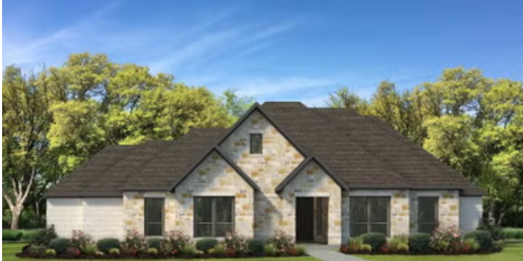
Elevation A | The Sonora