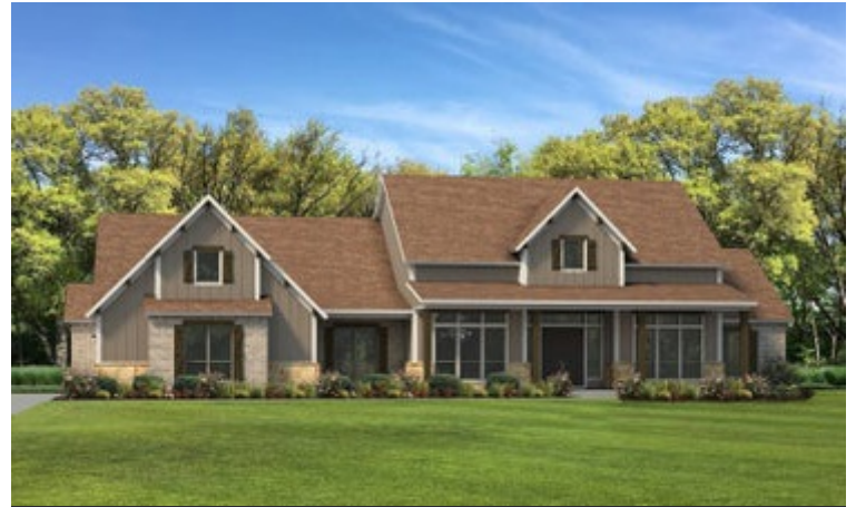
Elevation C | The Lone Star