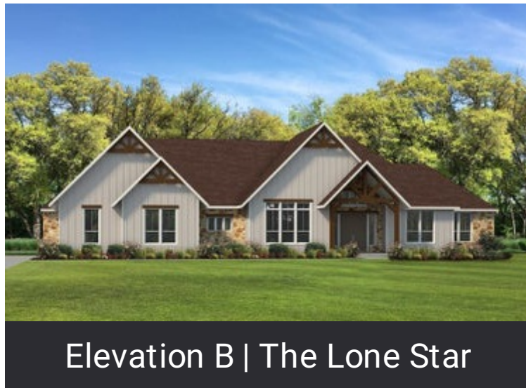
Elevation B | The Lone Star