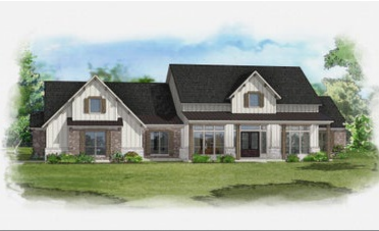
Model Coming Soon | The Lone Star C