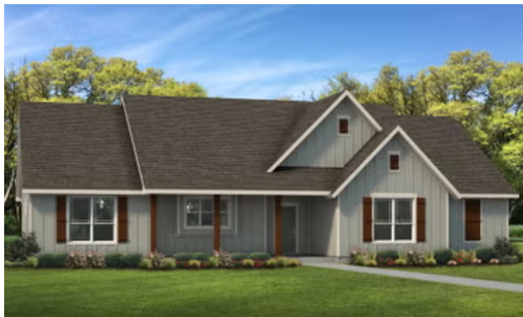
Elevation C | The Abilene