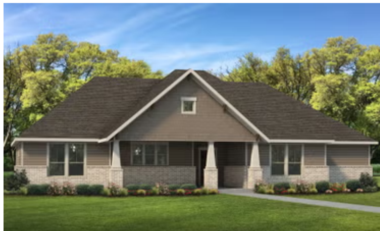
Elevation B | The Abilene