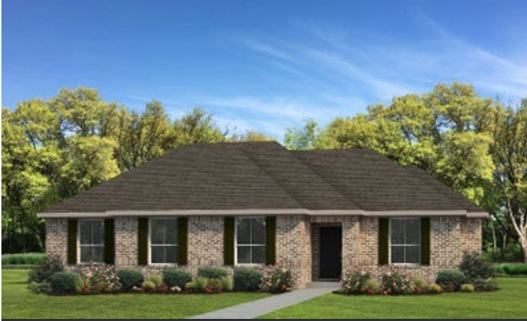
Elevation A - The Gonzales