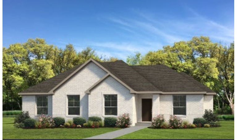
Elevation B - The Gonzales