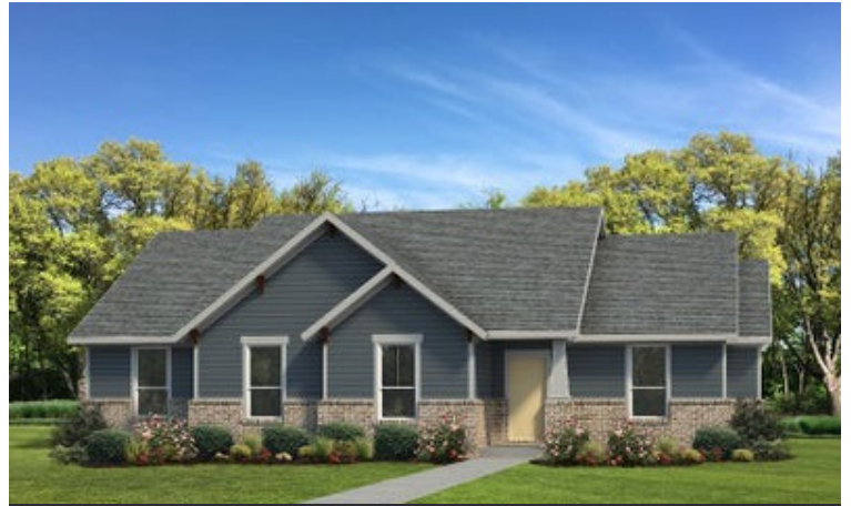
Elevation D - The Gonzales