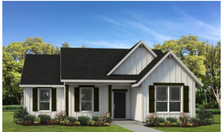
Elevation C - The Floresville