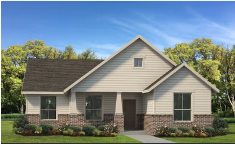
Elevation D - The Floresville