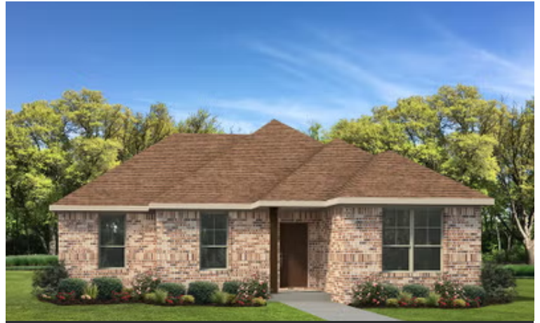
Elevation A - The Floresville