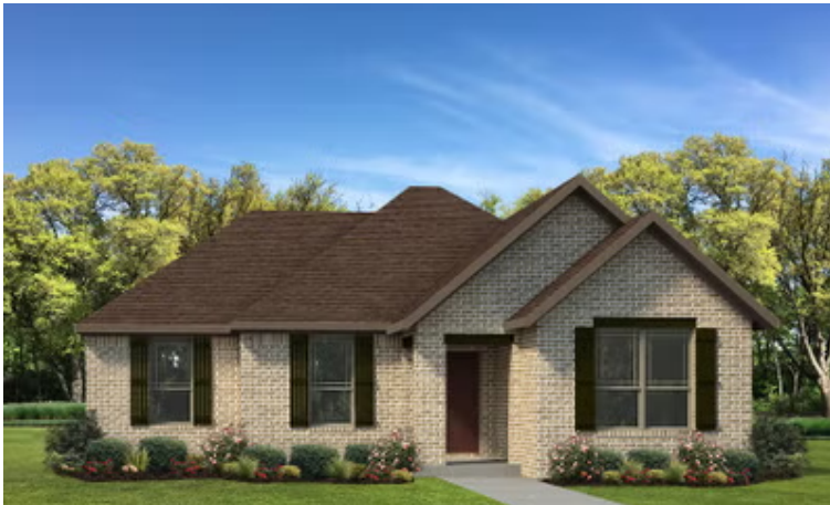
Elevation B - The Floresville