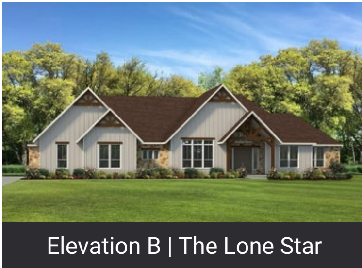
Elevation B | The Lone Star