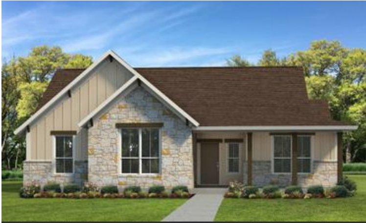
Elevation D - The Whitney