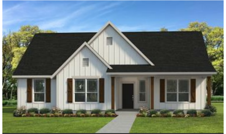
Elevation C - The Whitney