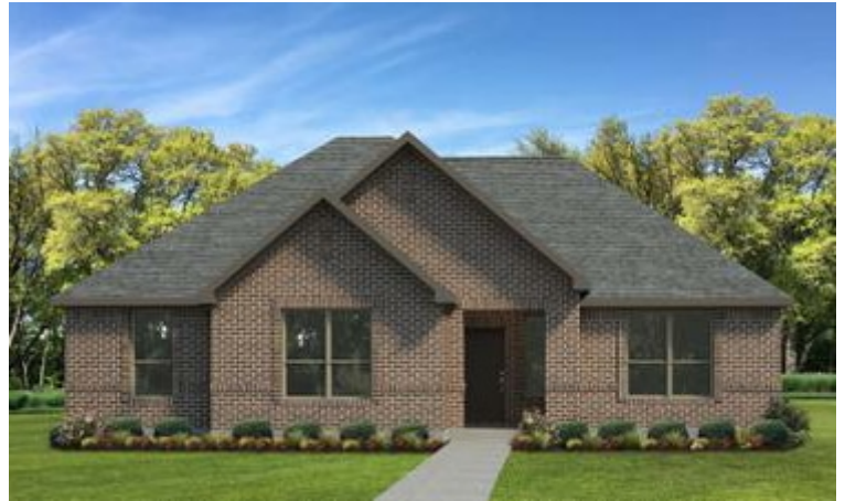
Elevation A - The Whitney