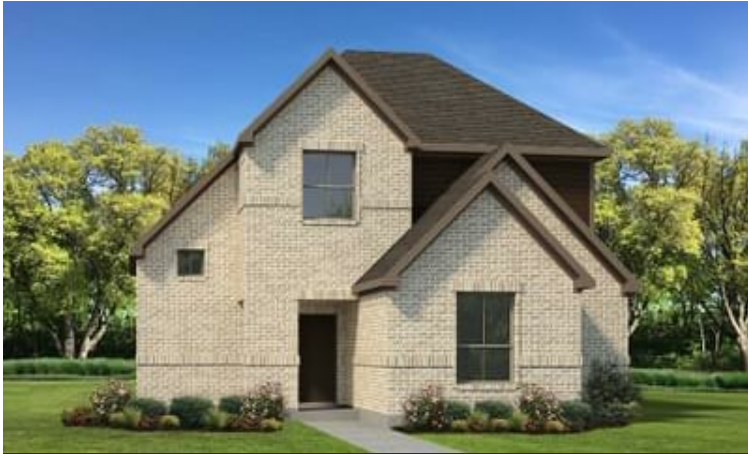
Elevation A - The Victoria