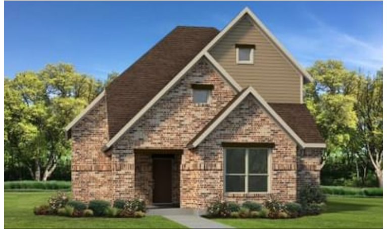
Elevation B - The Victoria