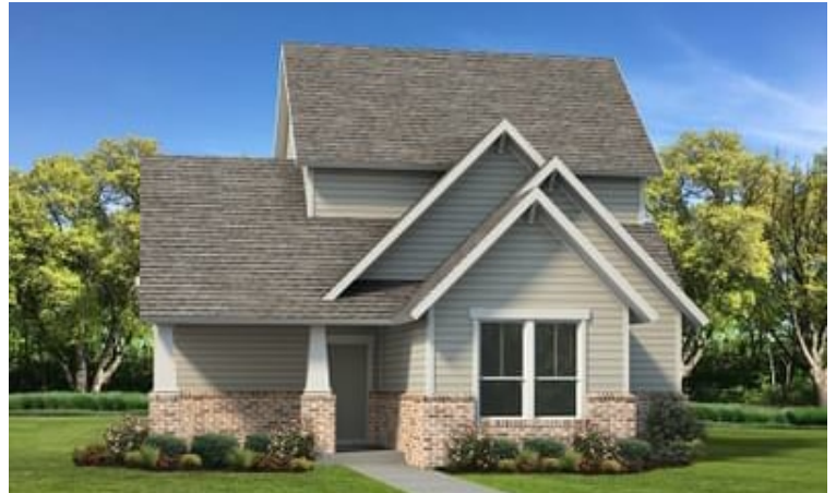
Elevation D - The Victoria