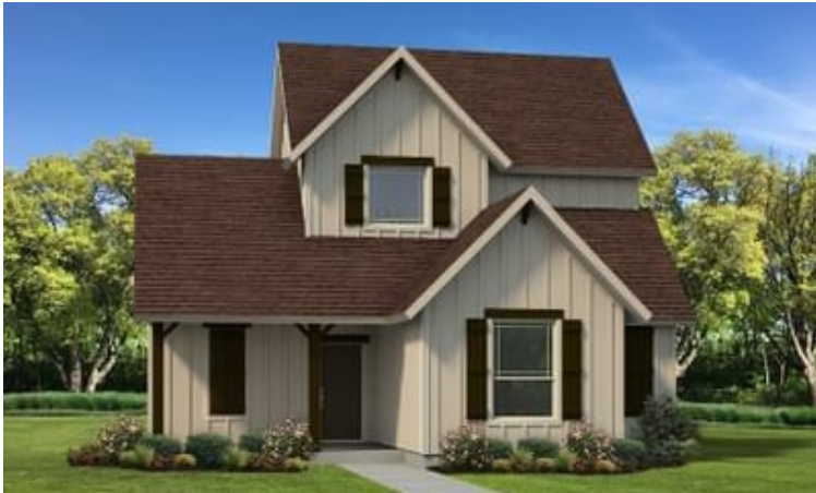
Elevation C - The Victoria