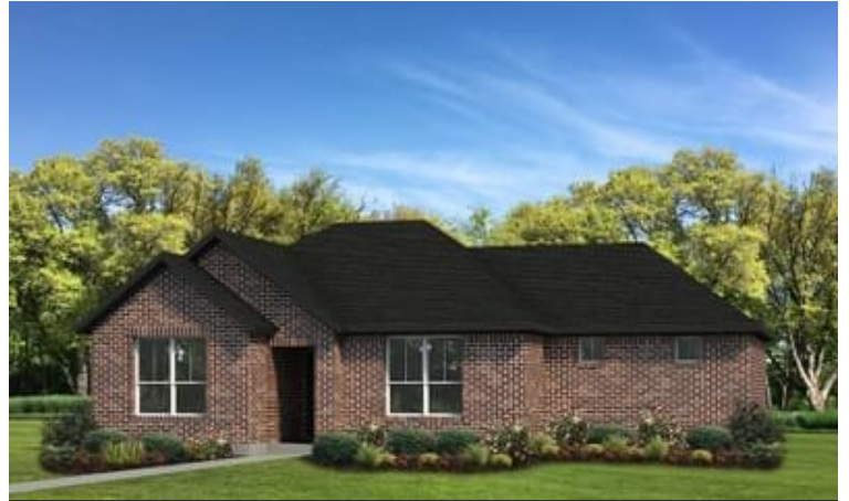
Elevation B - The Velasco