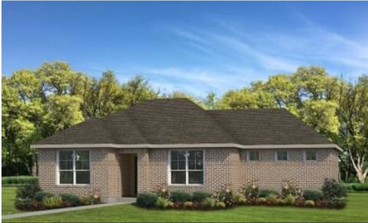
Elevation A - The Velasco