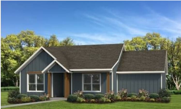
Elevation C - The Velasco