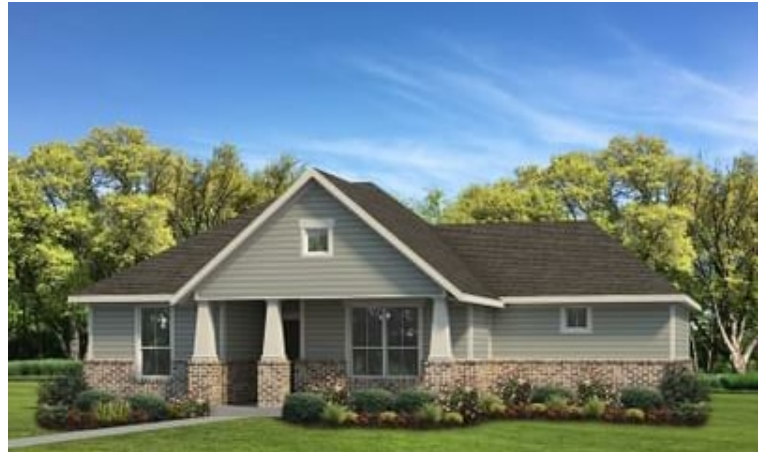
Elevation D - The Velasco