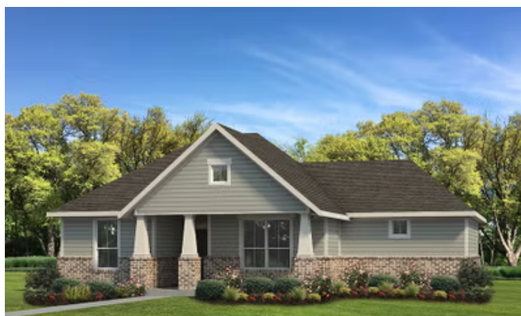
Elevation D - The Velasco