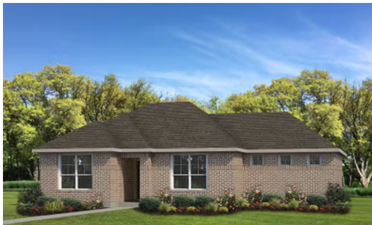
Elevation A - The Velasco