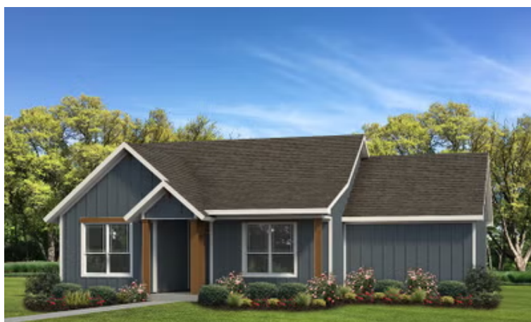
Elevation C - The Velasco