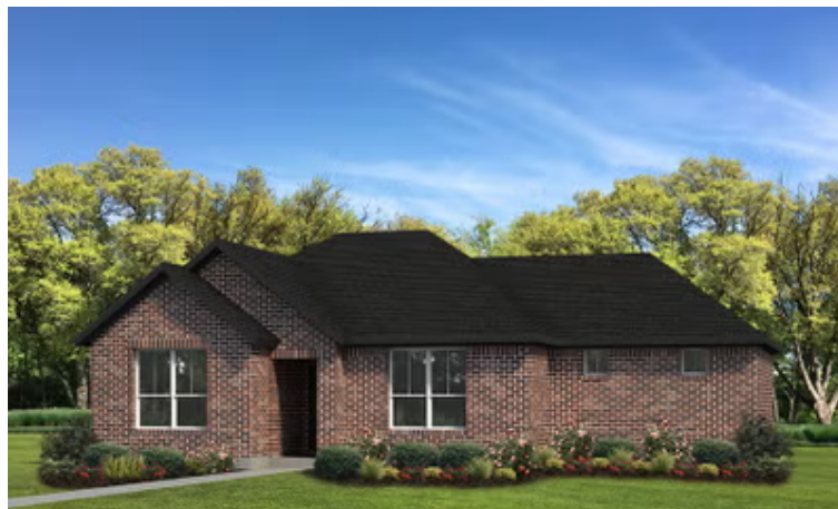
Elevation B - The Velasco