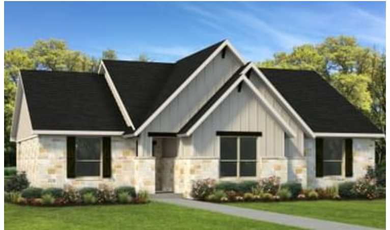
Elevation D | The Travis