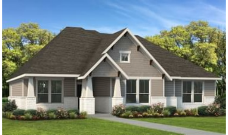
Elevation B | The Travis