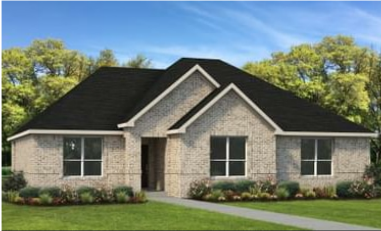
Elevation A | The Travis