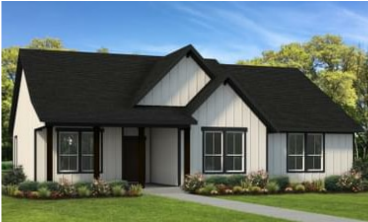
Elevation C | The Travis