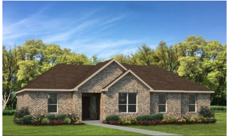
Elevation B - The Tampico