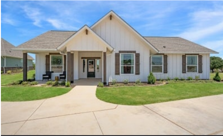
Elevation C - The Tampico | Model Located in Waco - May Contain Upgrades