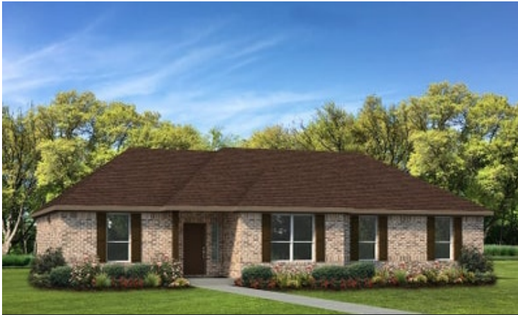
Elevation A - The Tampico