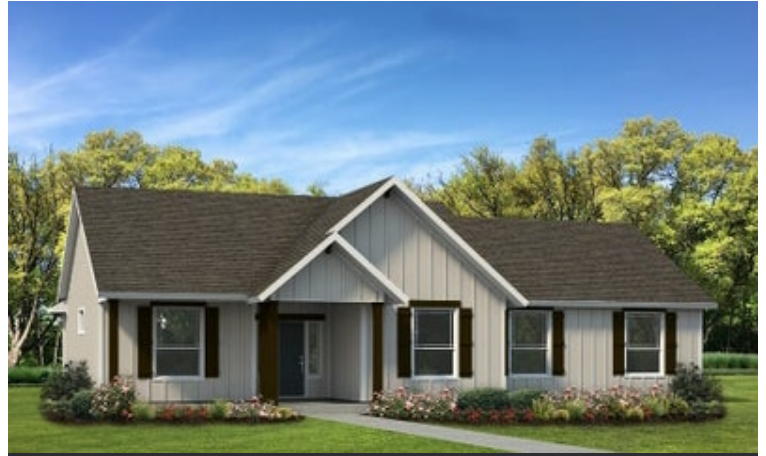
Elevation C - The Tampico