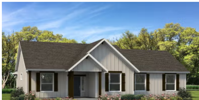
Elevation C - The Tampico