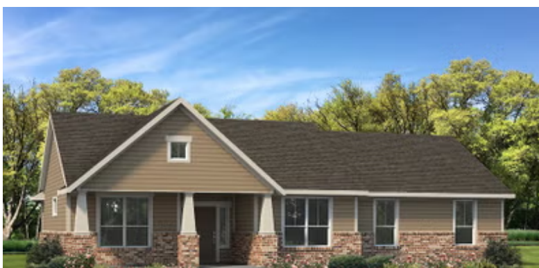
Elevation D - The Tampico