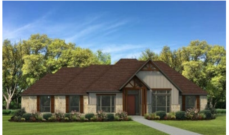
Elevation D | The Sonora