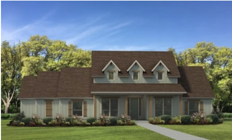
Elevation C | The Sonora