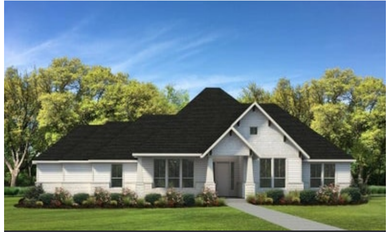
Elevation B | The Sonora