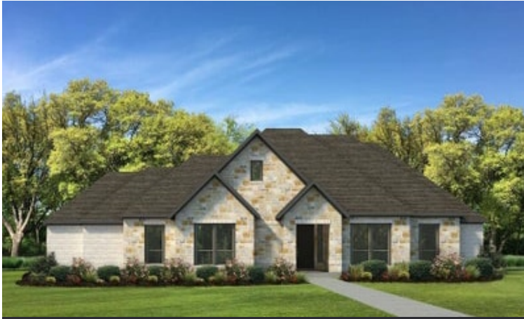
Elevation A | The Sonora