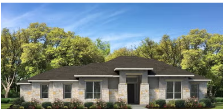
Elevation E | The Sonora