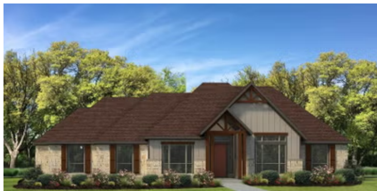
Elevation D | The Sonora