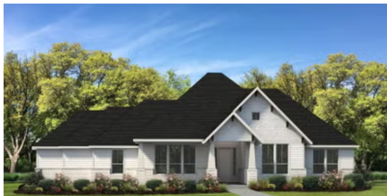
Elevation B | The Sonora