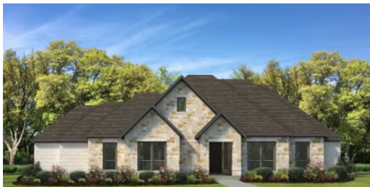
Elevation A | The Sonora