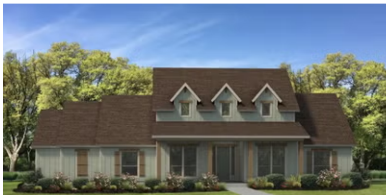
Elevation C | The Sonora