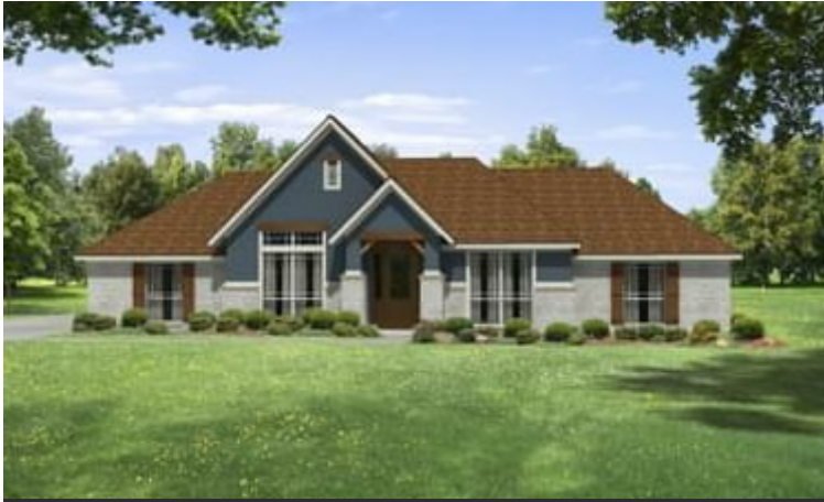
Elevation B - The San Jacinto