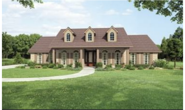
Elevation C - The San Jacinto