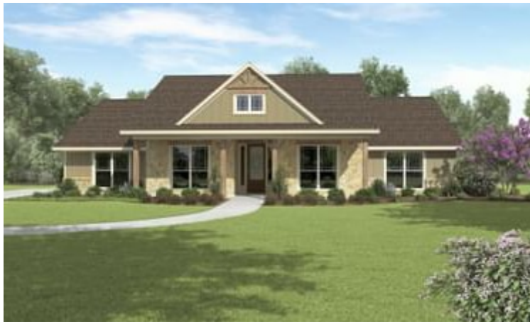
Elevation D - The San Jacinto