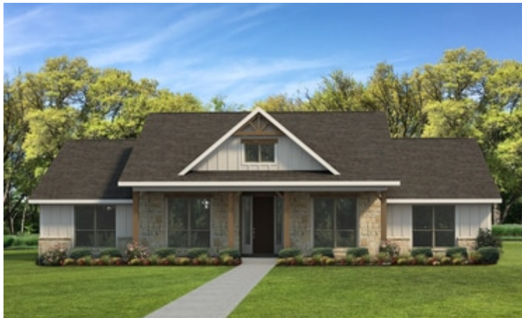
Elevation D | The San Jacinto