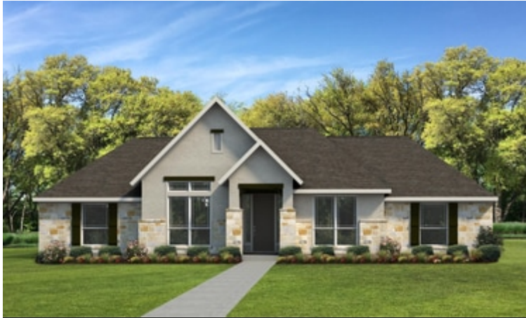
Elevation B | The San Jacinto