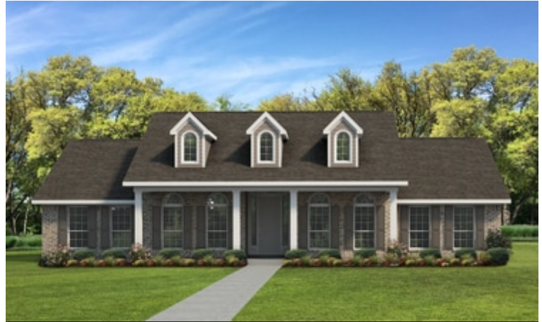
Elevation C | The San Jacinto