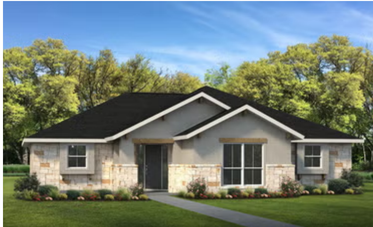
Elevation D - The San Gabriel