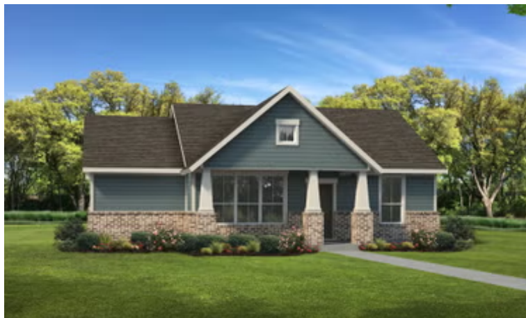
Elevation D - The San Antonio