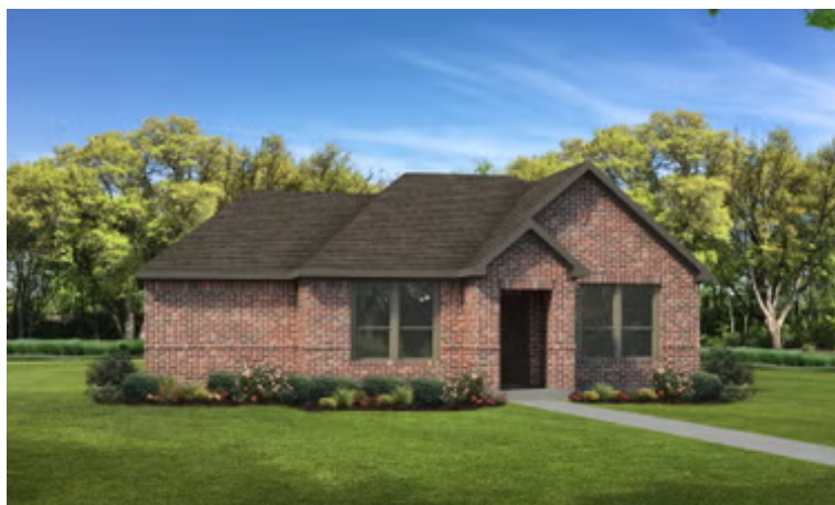
Elevation B - The San Antonio