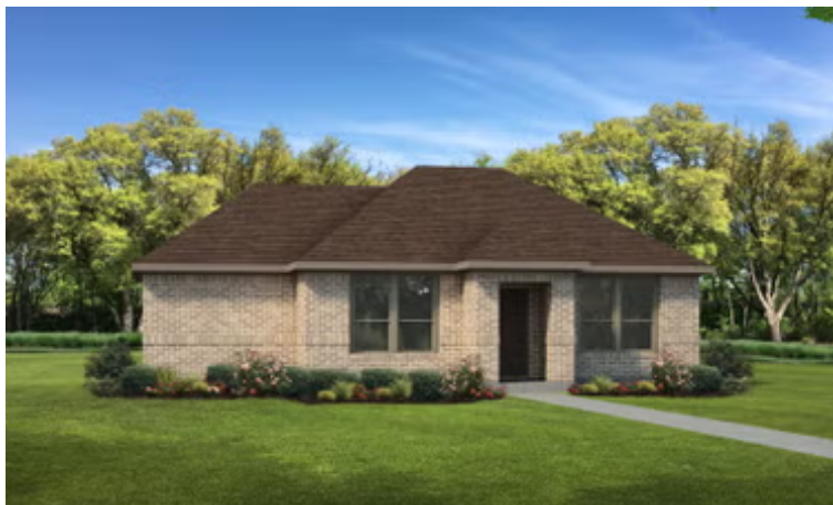
Elevation A - The San Antonio