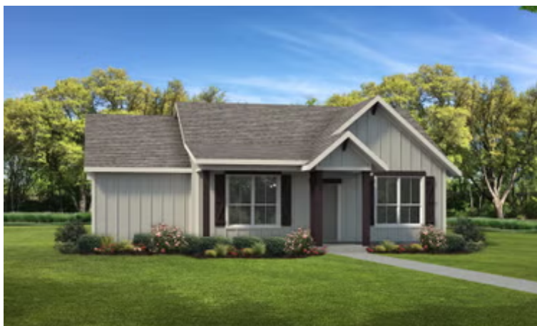
Elevation C - The San Antonio