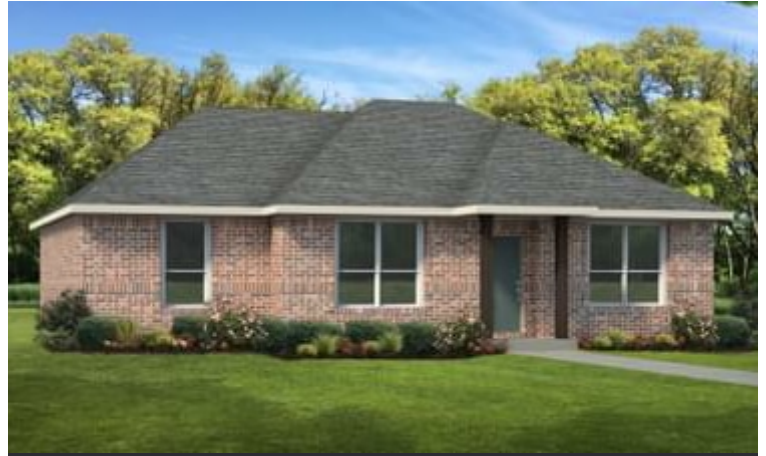
Elevation A - The Rio