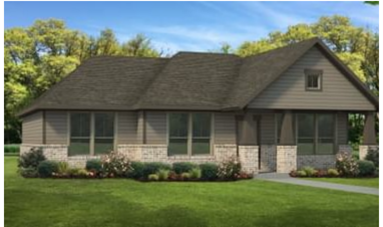
Elevation D - The Rio