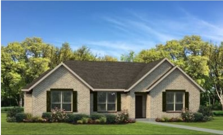
Elevation B - The Refugio