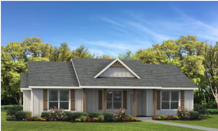
Elevation C - The Refugio