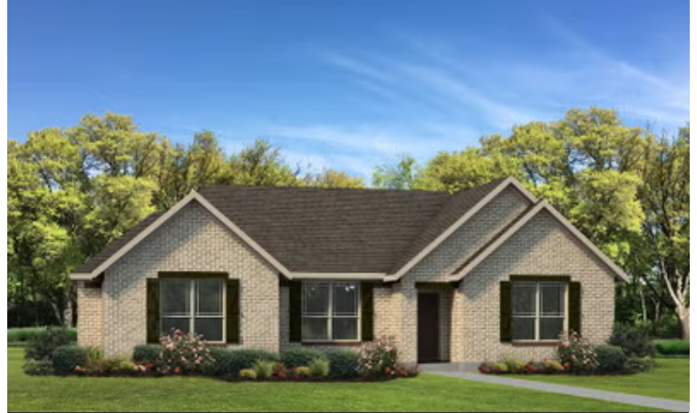
Elevation B - The Refugio