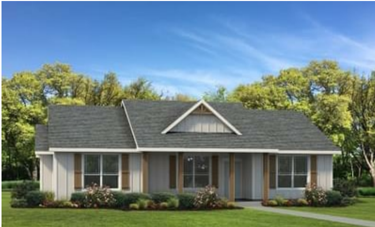
Elevation C - The Refugio