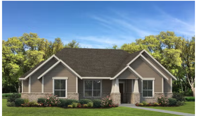
Elevation D - The Refugio