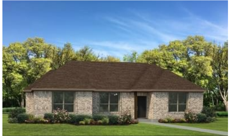
Elevation A - The Refugio