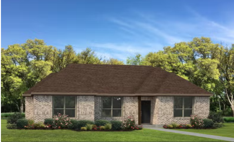
Elevation A - The Refugio