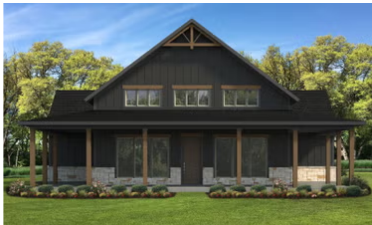
Front Exterior - Ranger B | Rendered Home - May Contain Upgraded Design Options