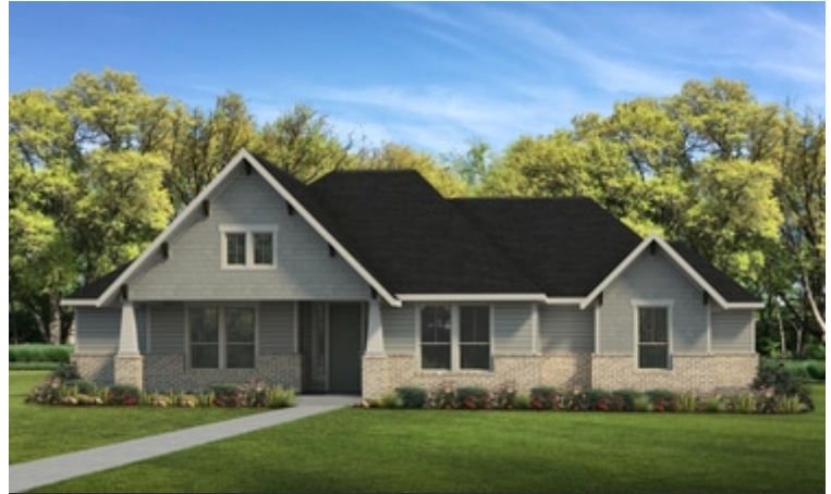
Elevation B | The Palo Duro