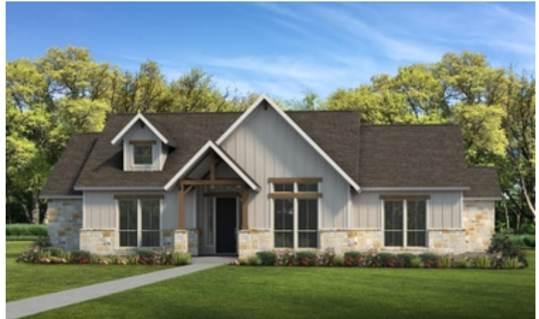
Elevation D | The Palo Duro