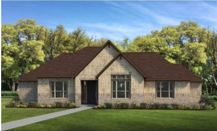
Elevation A | The Palo Duro