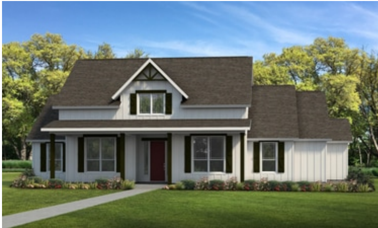
Elevation C | The Palo Duro