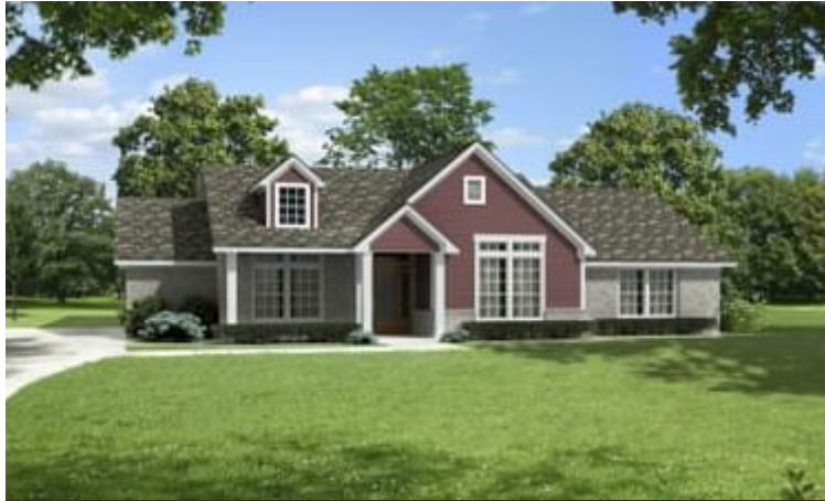
Elevation C - The Palacios