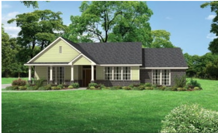
Elevation C - The Nueces