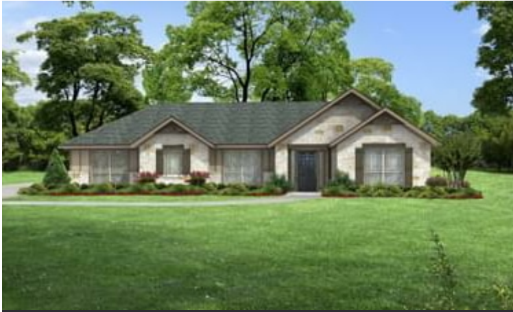
Elevation D - The Nottingham