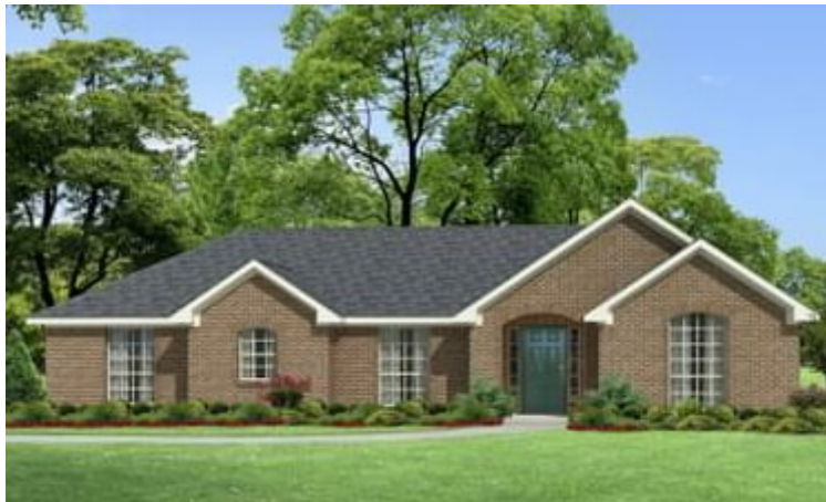
Elevation B - The Nottingham