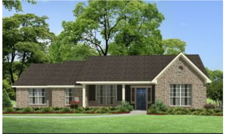
Elevation C - The Nottingham