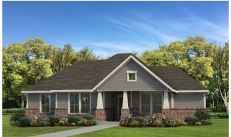
Elevation D - The Nacogdoches