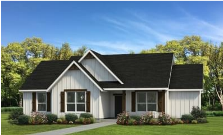
Elevation C - The Nacogdoches