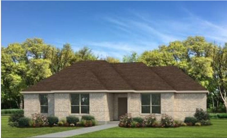
Elevation A - The Nacogdoches