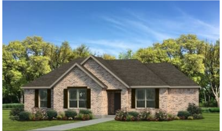
Elevation B - The Nacogdoches