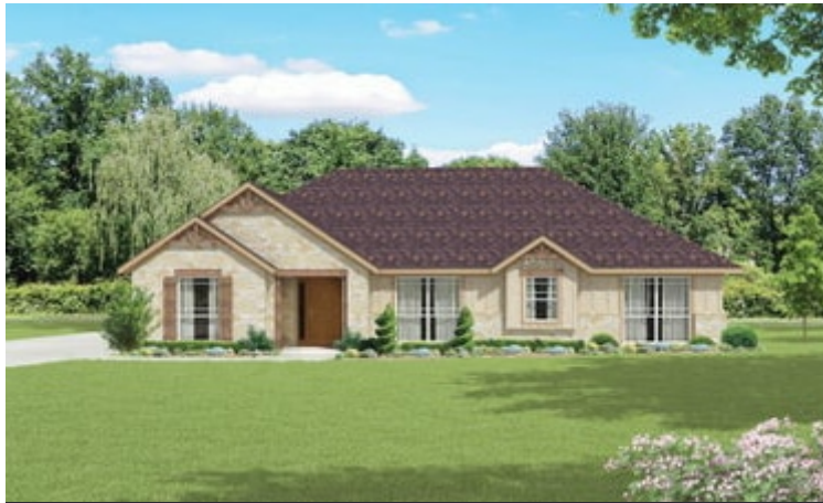
Elevation C - The Marian