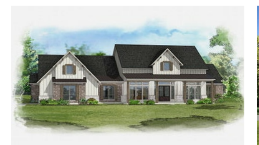
Model Coming Soon | The Lone Star C