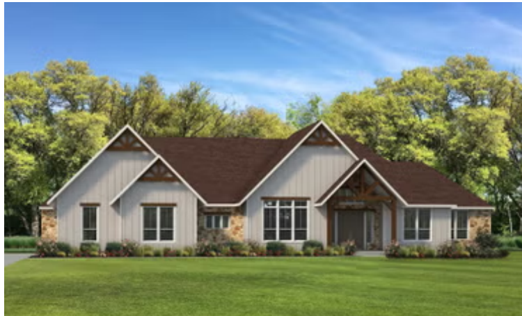
Elevation B | The Lone Star