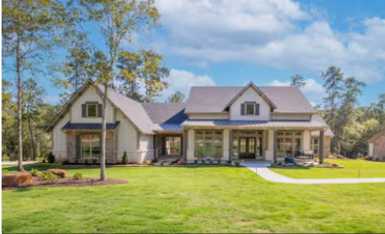
Model Home | The Lone Star C