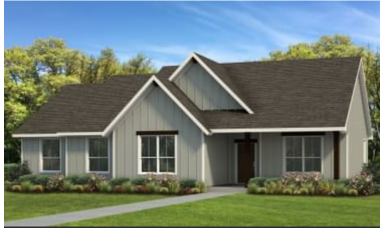
Elevation C | The Livingston