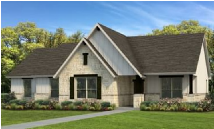
Elevation D | The Livingston