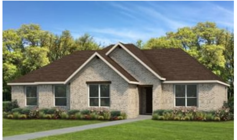
Elevation A | The Livingston