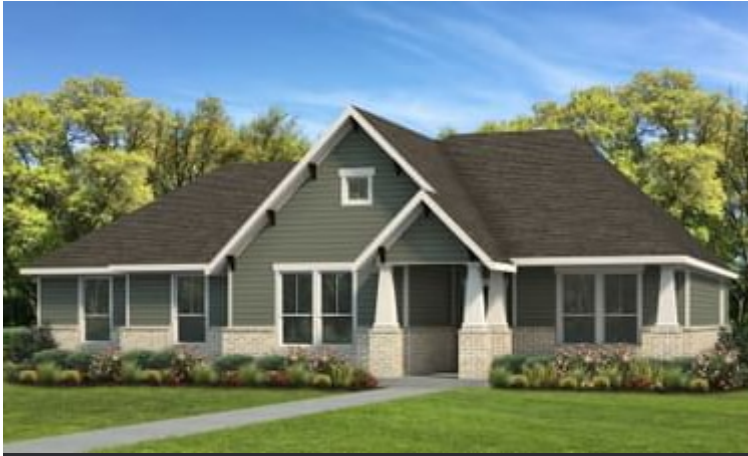
Elevation B | The Livingston