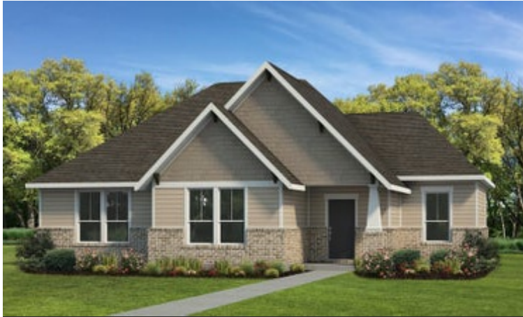
Elevation B | The Live Oak