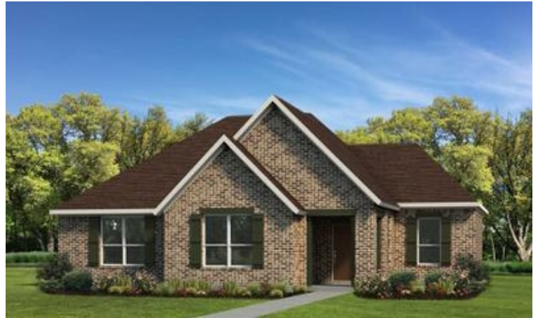
Elevation A | The Live Oak