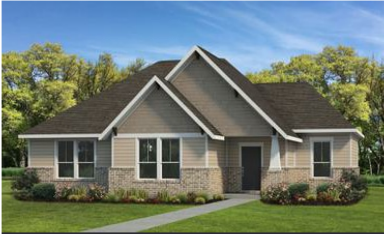
Elevation B | The Live Oak