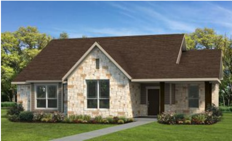
Elevation D | The Live Oak