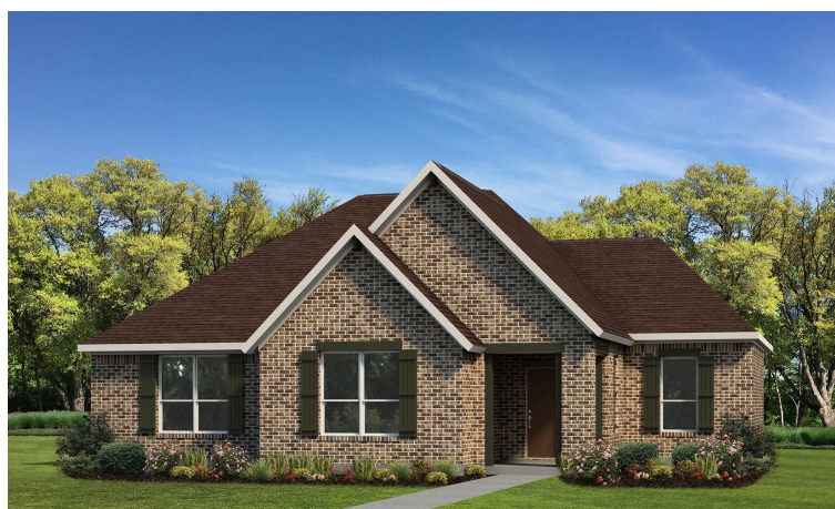
Elevation A | The Live Oak