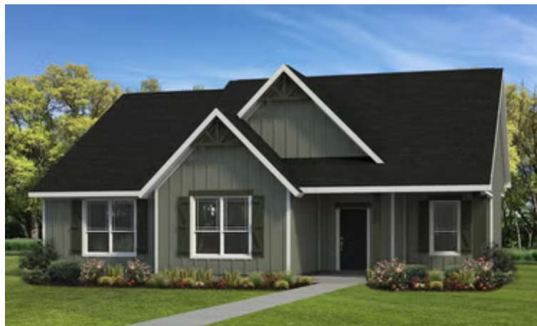
Elevation C | The Live Oak