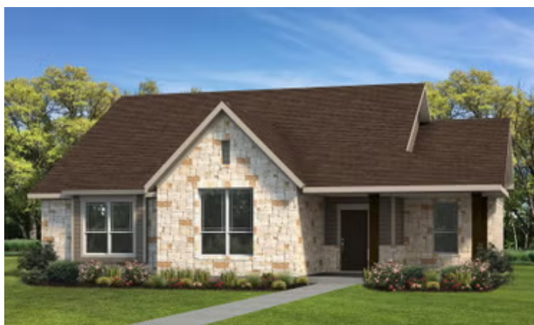
Elevation D | The Live Oak