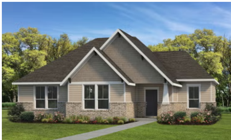
Elevation B | The Live Oak