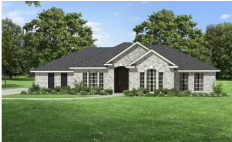
Elevation B - The Hidalgo