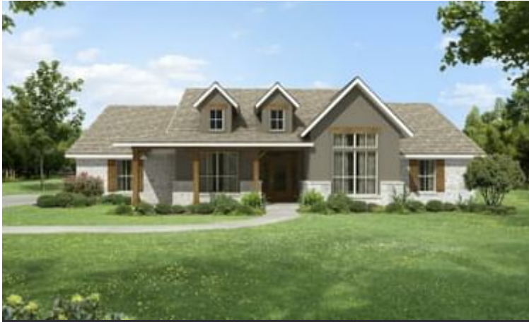
Elevation D - The Hidalgo