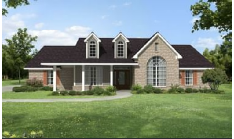
Elevation C - The Hidalgo