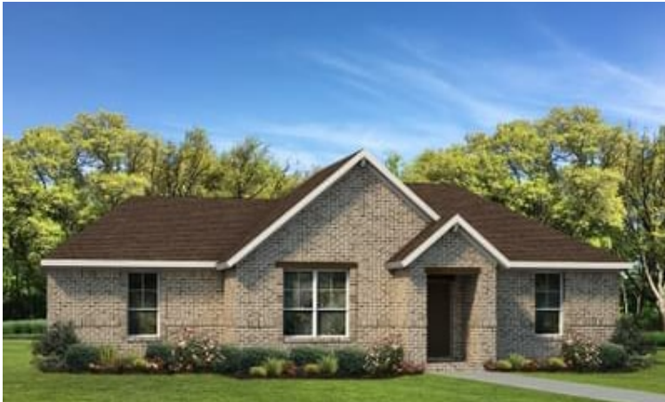
Elevation B - The Harrisburg