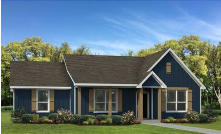
Elevation C - The Harrisburg