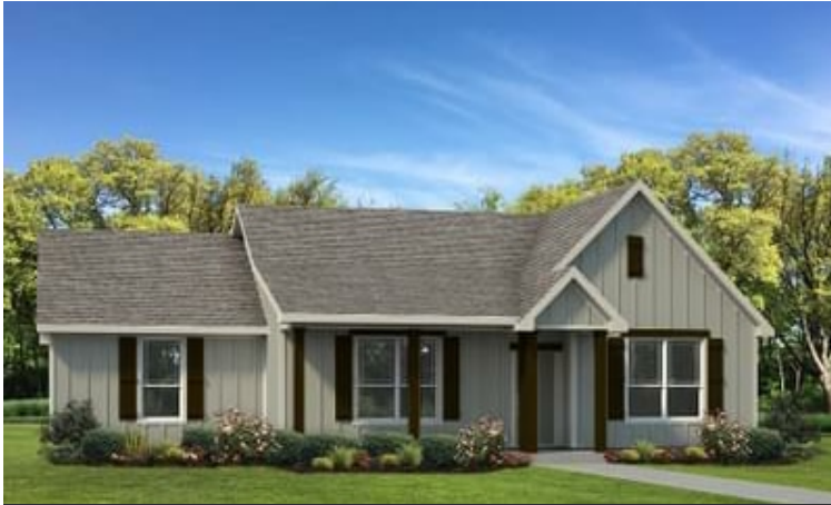
Elevation C - The Harrisburg