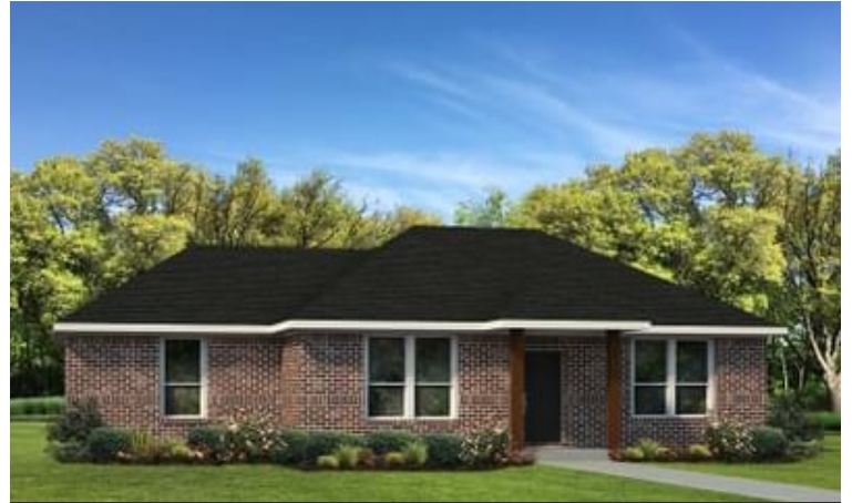
Elevation A - The Harrisburg