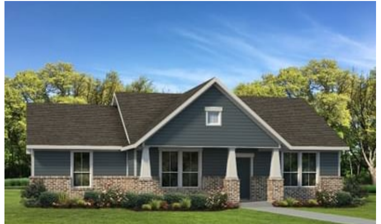
Elevation D - The Harrisburg