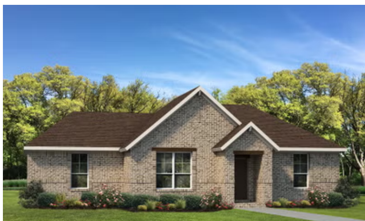
Elevation B - The Harrisburg