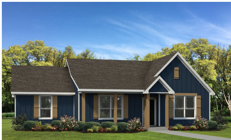
Elevation C - The Harrisburg