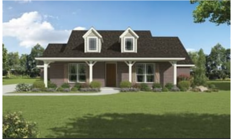
Elevation C - The Guadalupe