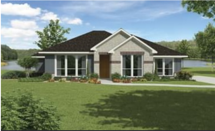
Elevation D - The Guadalupe