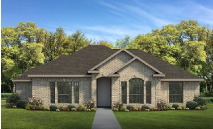
Elevation B - The Guadalupe