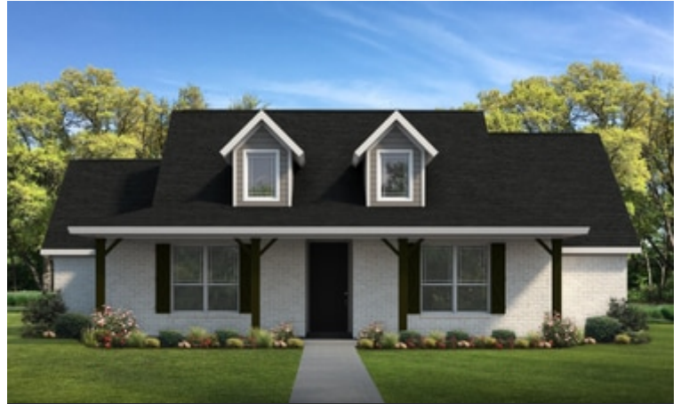
Elevation C - The Guadalupe