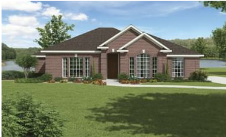
Elevation B - The Guadalupe