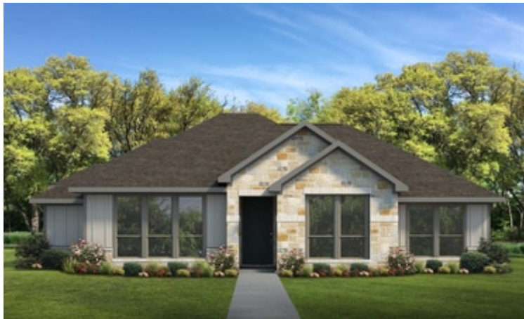
Elevation D - The Guadalupe