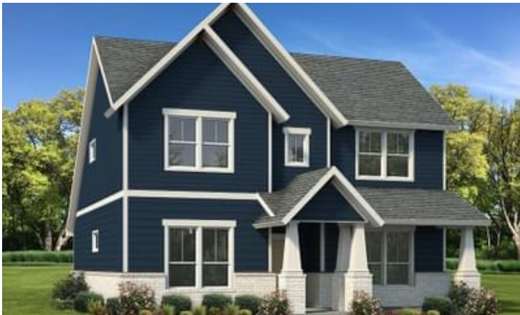
Elevation D - The Goliad