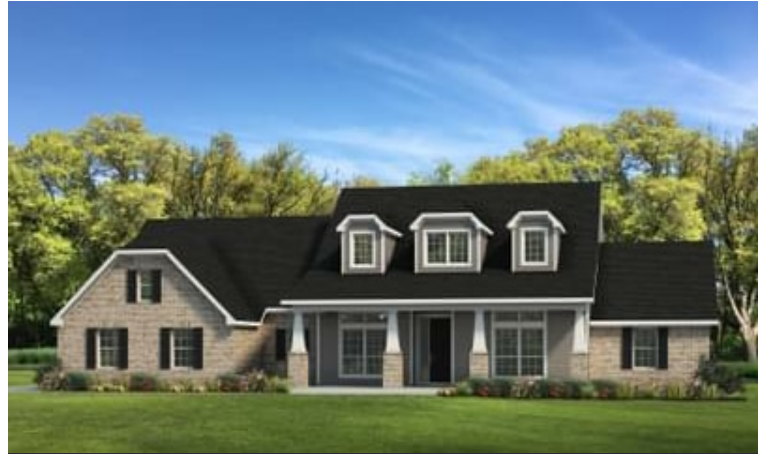
Elevation C - The Fredericksburg