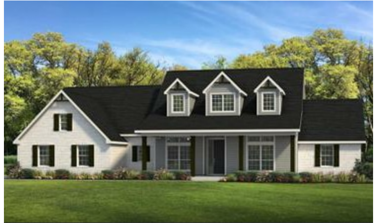
Elevation C - The Fredericksburg