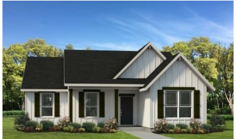
Elevation C - The Floresville