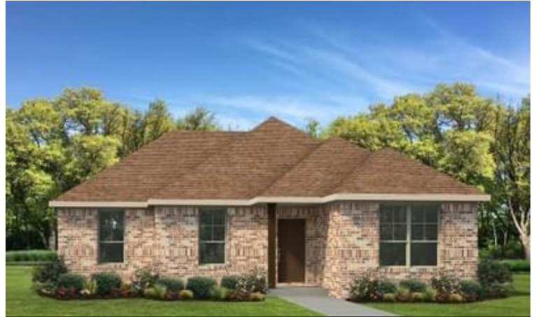
Elevation A - The Floresville