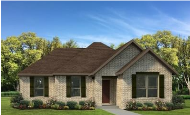
Elevation B - The Floresville