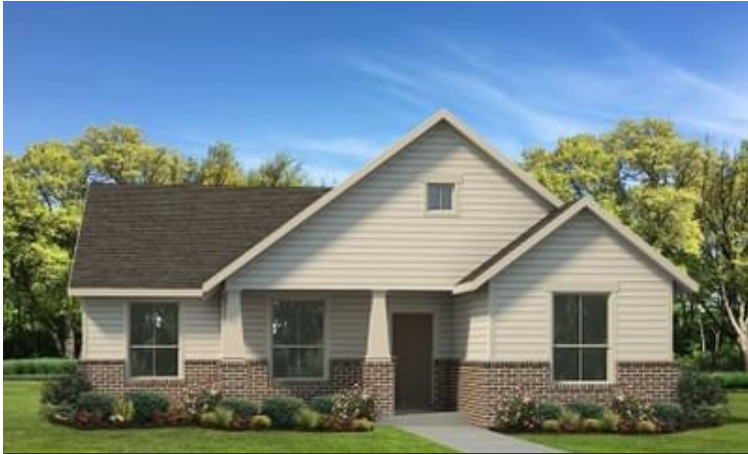
Elevation D - The Floresville