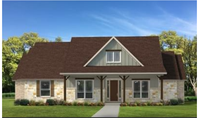
Elevation C - The Fayetteville