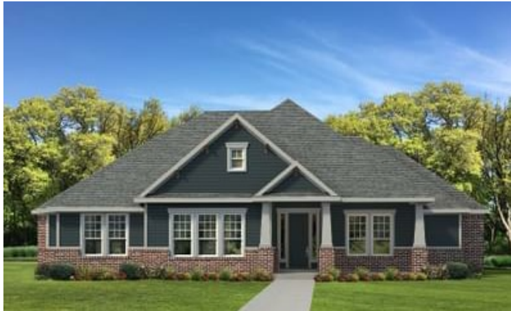
Elevation D - The Fayetteville