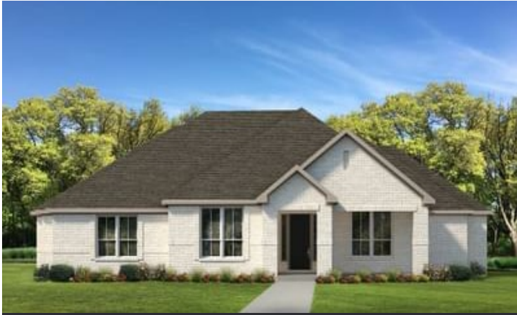
Elevation B - The Fayetteville