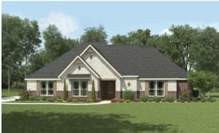
The Cypress - Elevation B