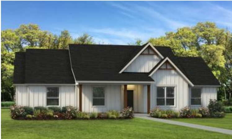
Elevation C | Cisco